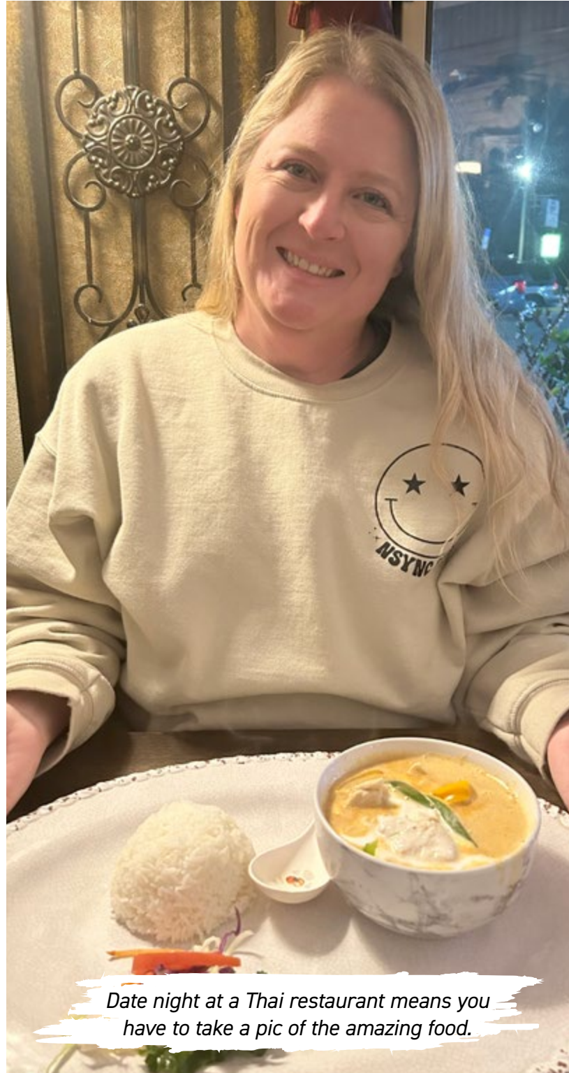
Date night at a Thai restaurant means you have to take a pic of the amazing food.

I am a stay-at-home mom, but my love of learning extends beyond the home. I have a Bachelor's in Exercise Science and another Bachelor's in Health Science. (Nutrition and food science). Despite the cookie-making, I have a love for health and fitness and have even completed two marathons!