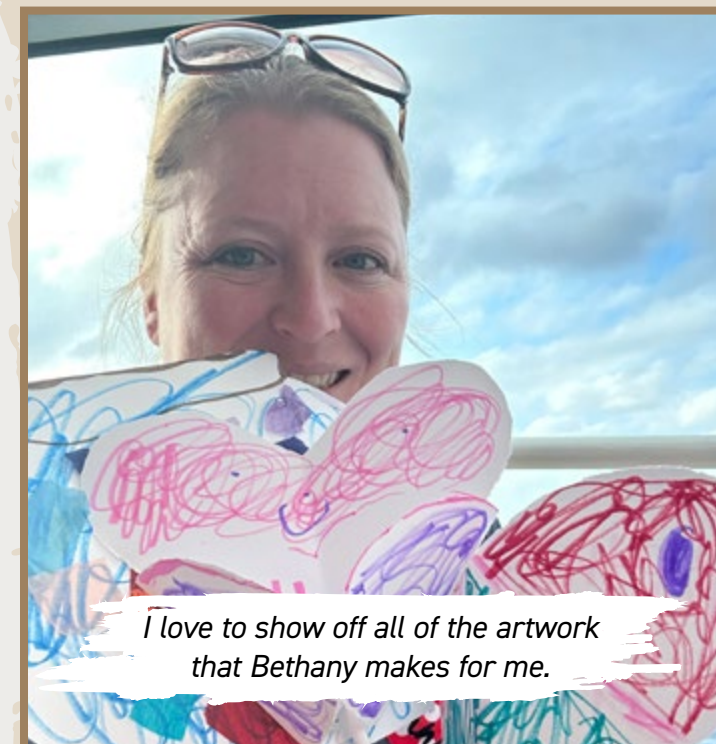
I love to show off all of the artwork that Bethany makes for me.