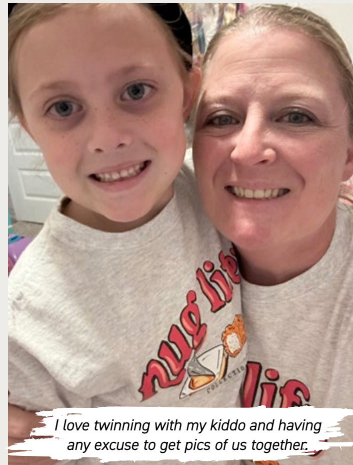
I love twinning with my kiddo and having any excuse to get pics of us together.