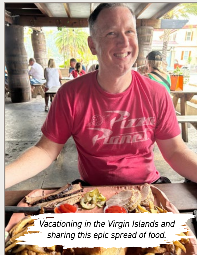
Vacationing in the Virgin Islands and sharing this epic spread of food.