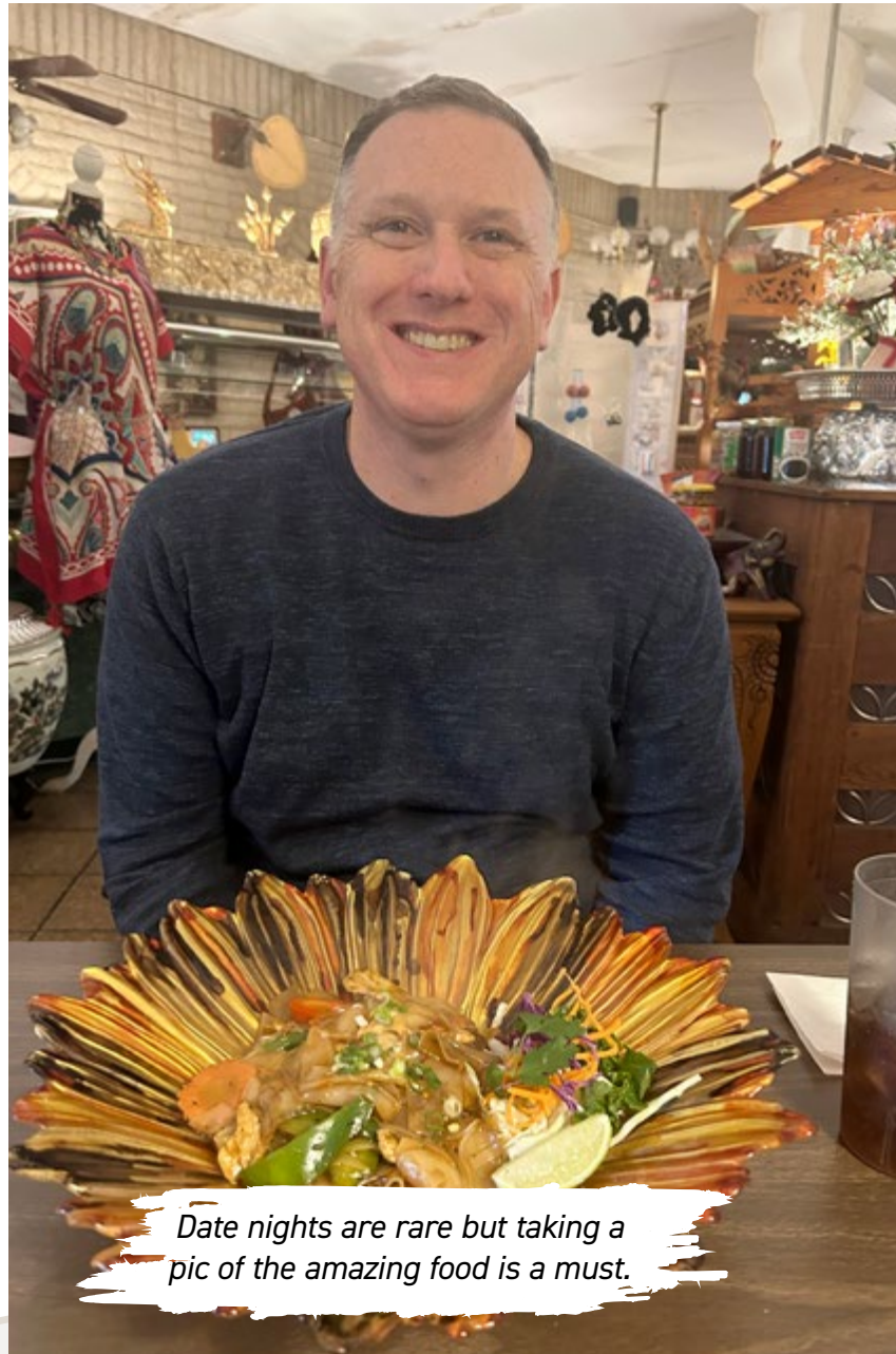
Date nights are rare but taking a pic of the amazing food is a must.

I have a love of learning about the world. The Navy has taken me to many different countries, and I am fortunate to travel the world. I hope to share the joy of these experiences to fill the heart and mind of a child.