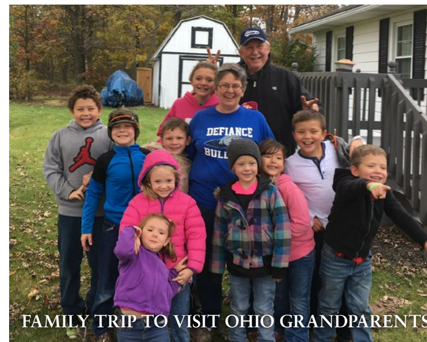
FAMILY TRIP TO VISIT OHIO GRANDPARENTS