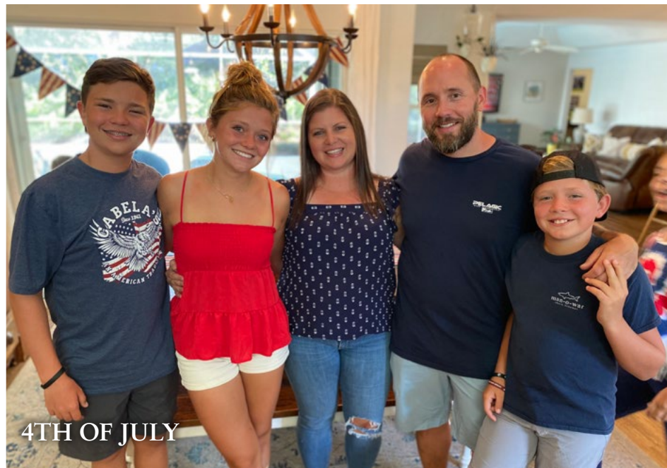
4TH OF JULY

In 2014, we bought a home we love. It's spacious with four bedrooms, an open layout, a pool, and a large backyard where we've created countless memories. We often host Thanksgiving and Christmas celebrations, which have become cherished family traditions.