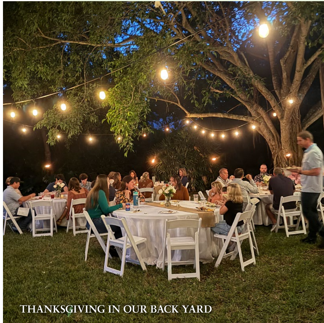
THANKSGIVING IN OUR BACK YARD

In 2014, we bought a home we love. It's spacious with four bedrooms, an open layout, a pool, and a large backyard where we've created countless memories. We often host Thanksgiving and Christmas celebrations, which have become cherished family traditions.