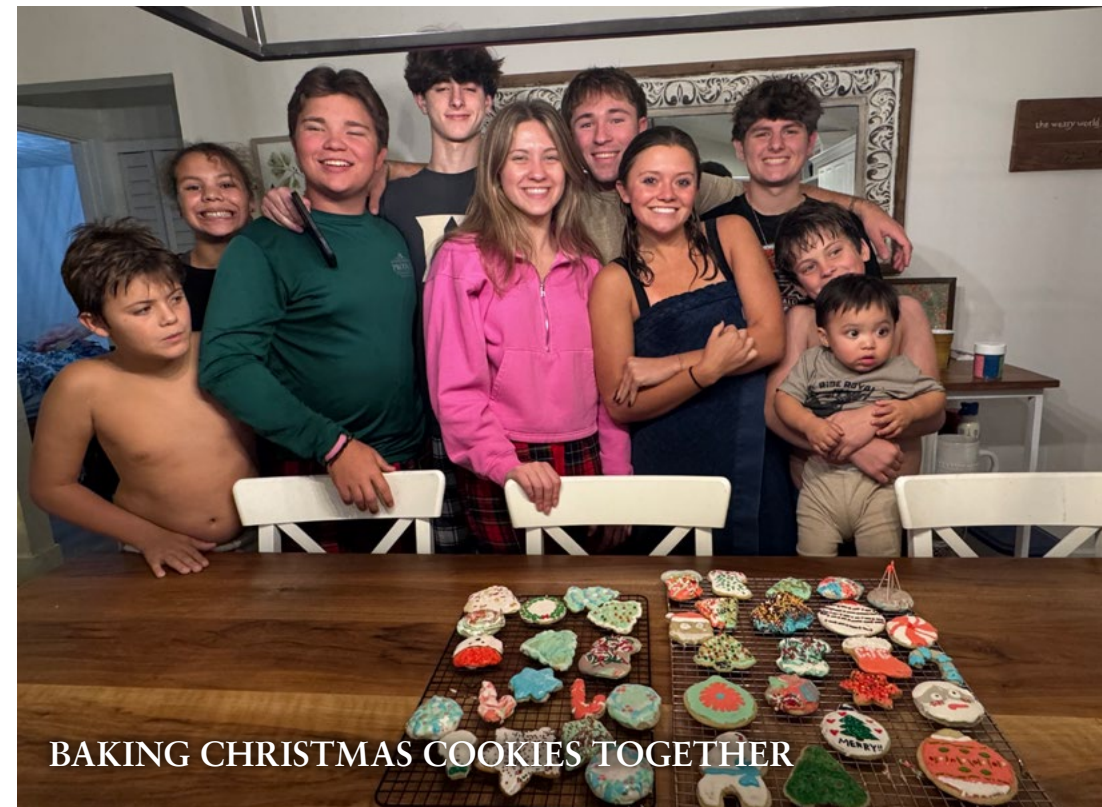
BAKING CHRISTMAS COOKIES TOGETHER

We're so excited to welcome a child into our home and share all of the beauty, fun, and love that our community has to offer.