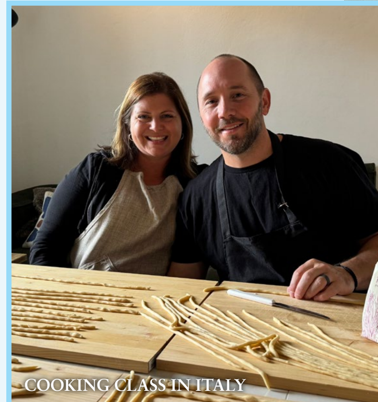
COOKING CLASS IN ITALY

Adoption has always been something we've felt called to. We've fostered twenty children, and while we've loved getting to know the children and their families, the primary goal of foster care is reunification, and we are grateful to have been part of many positive outcomes. We've maintained contact with several of the families and are hopeful that adoption is part of God's plan for us.