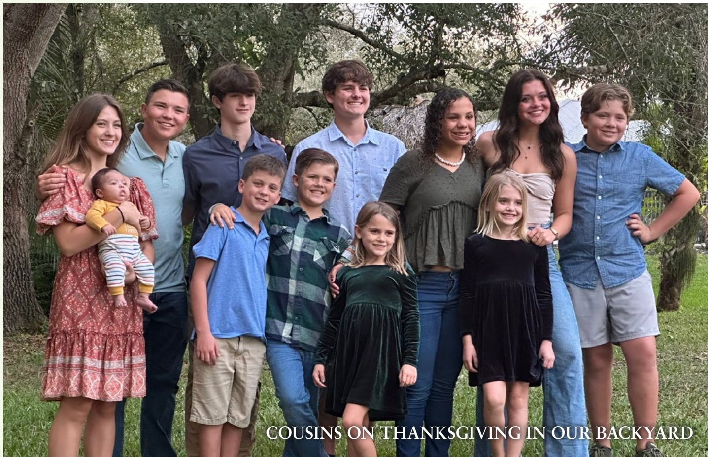
COUSINS ON THANKSGIVING IN OUR BACKYARD

Through all of life's ups and downs, our family remains close-knit. We enjoy spending time together – whether fishing on our boat, playing pickleball, or hosting church events at our home.